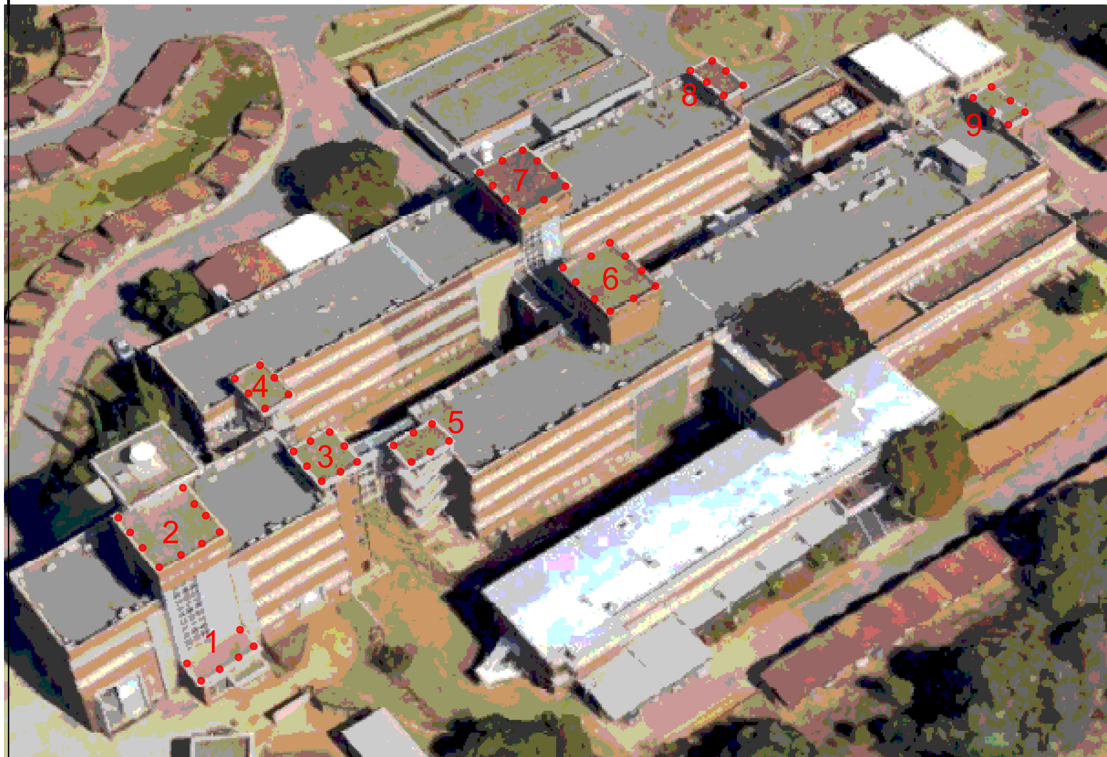
KEY PLAN SCALE N.T.S.