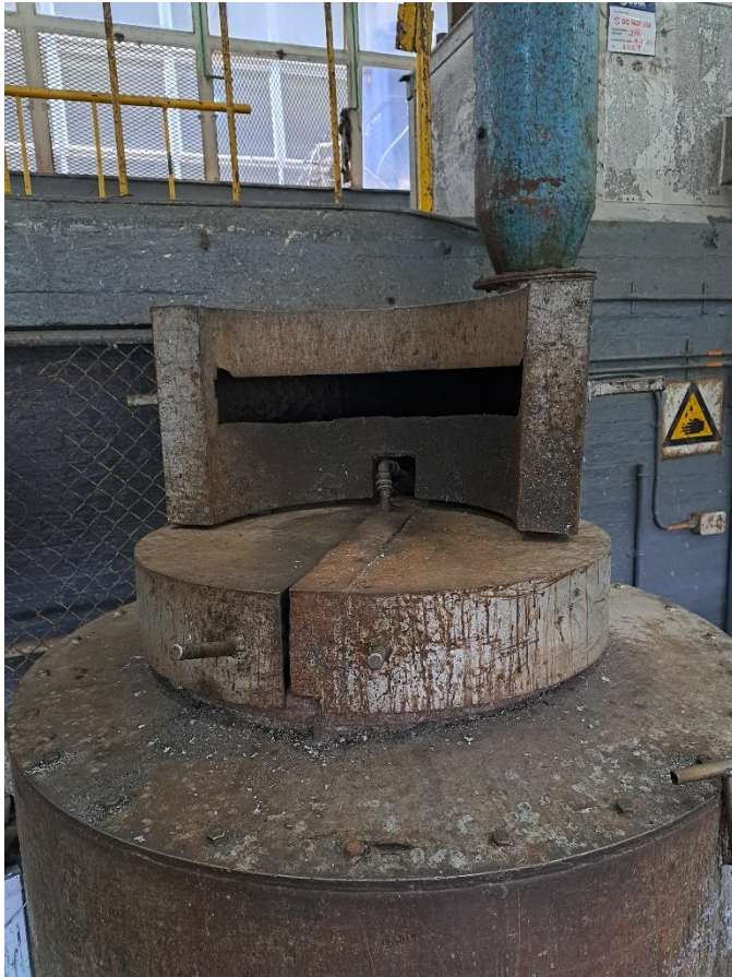
Fig 3B: Extraction duct and hood in a closed position