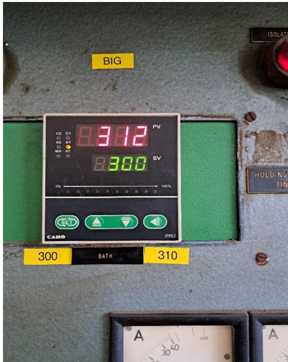
Fig 4: Temperature controller