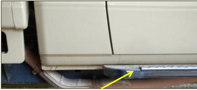
Figure 3: Cab bottom seams