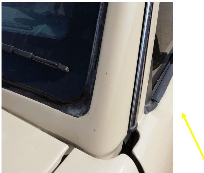
Figure 4: Paint at window trimming