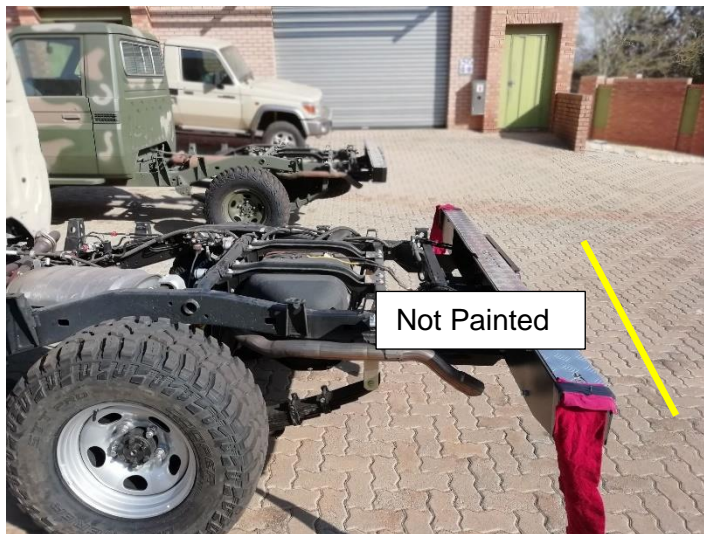
Figure 14: Rear Bumper