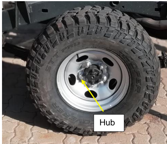
• Figure 15: Wheels and rims