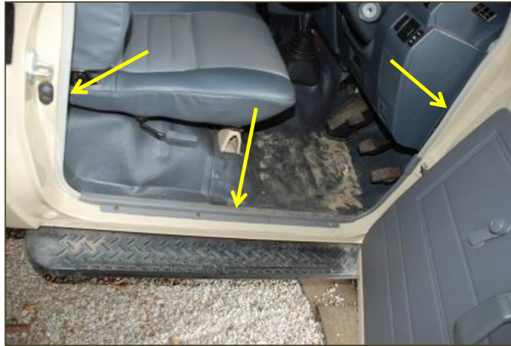
Figure 7: Cab inside