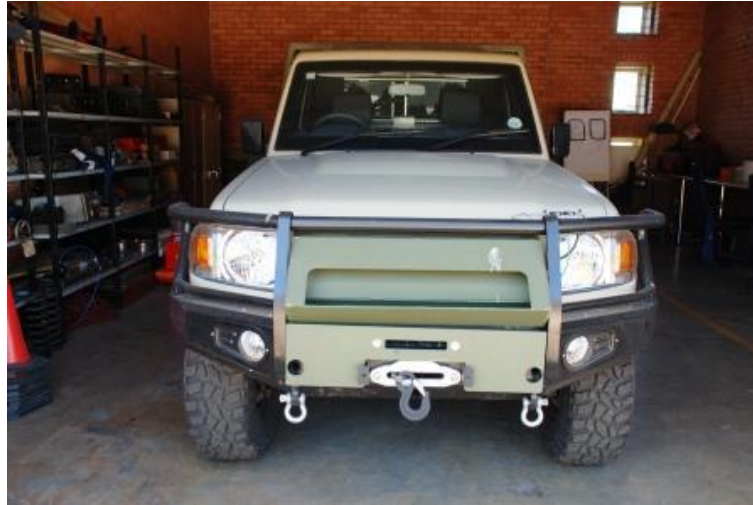
Figure 13: Front Bumper