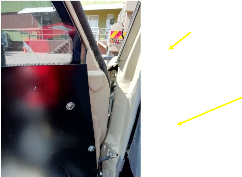
Figure 9: Masked areas on door