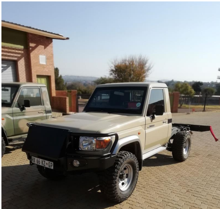
Figure 2: Vehicle cab to be painted