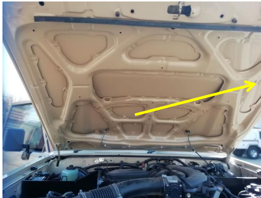
Figure 11: Vehicle Bonnet