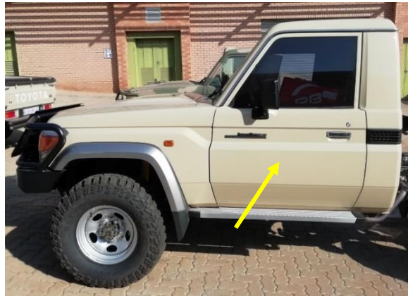
Figure 8: Door outside