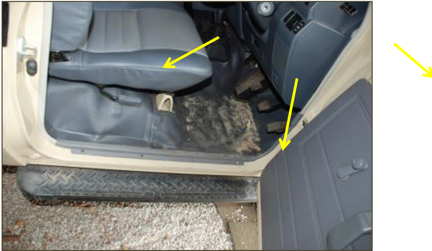
Figure 5: Cab inside