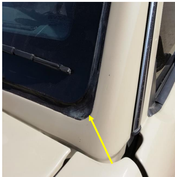
Figure 6: Paint at window trimming