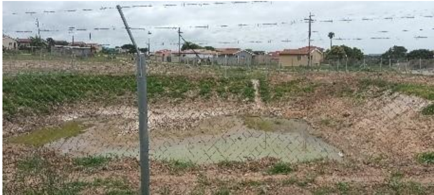
Figure 3: Stormwater (Detention Pond)