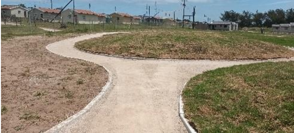
Figure 2: Landscape (Park areas and pathways)