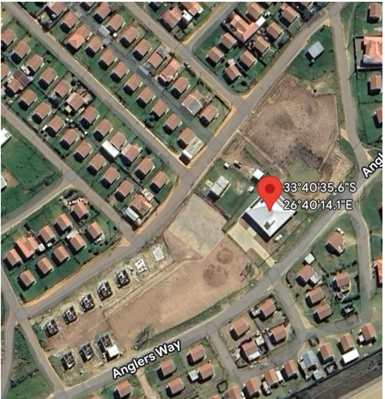
Figure 4: Arial site view.