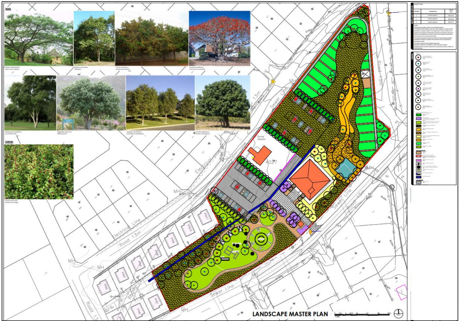
Figure 6: Landscaping plan.