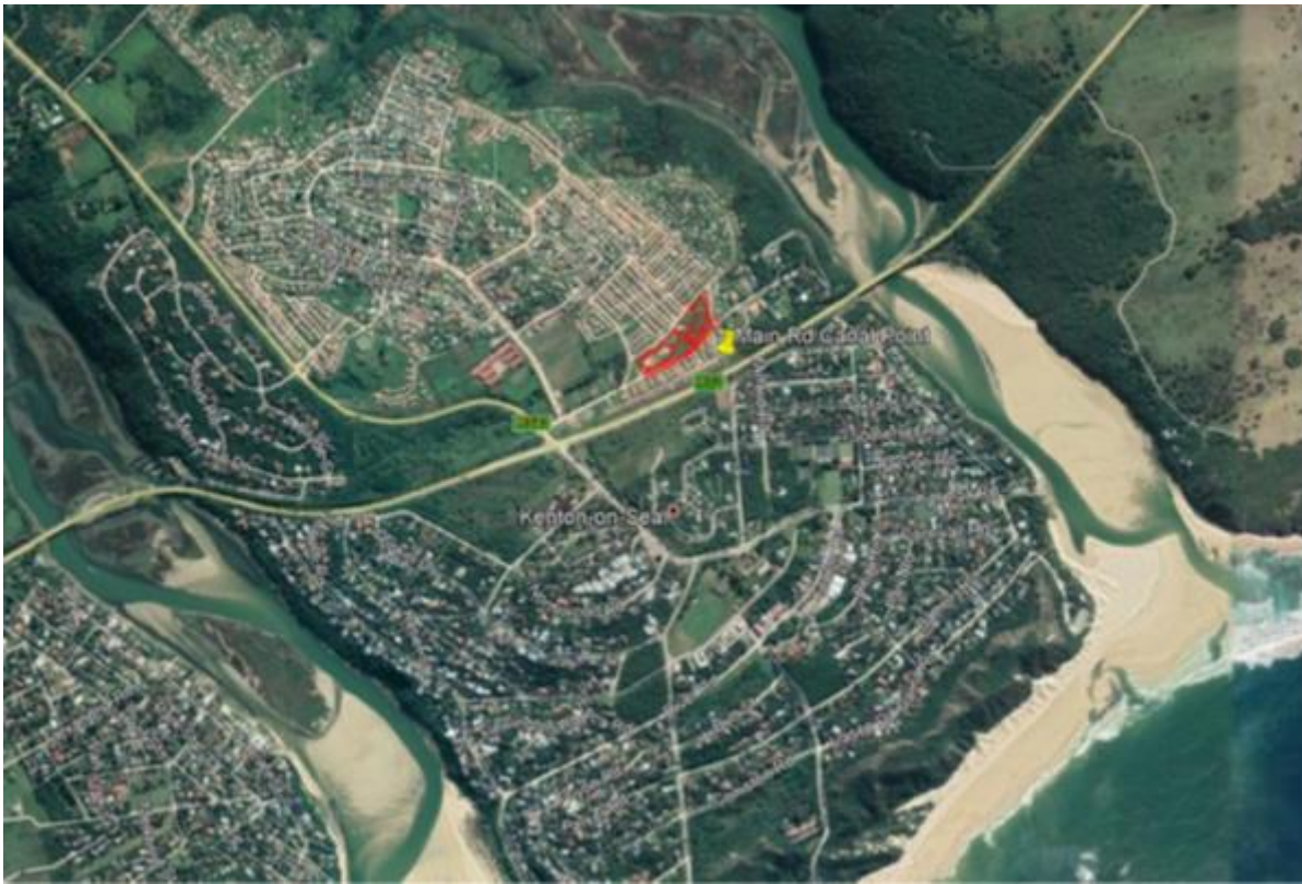
Figure 7. Kenton on Sea locality plan