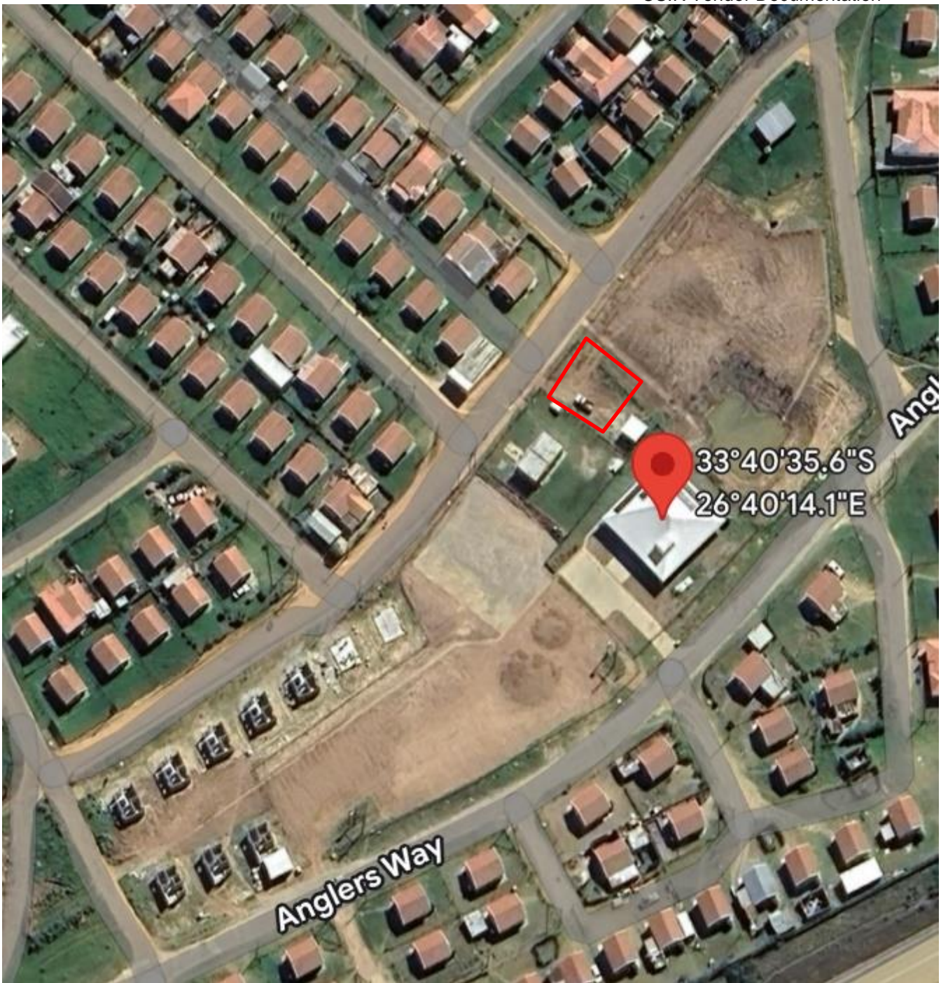
Figure 3: Aerial site view.