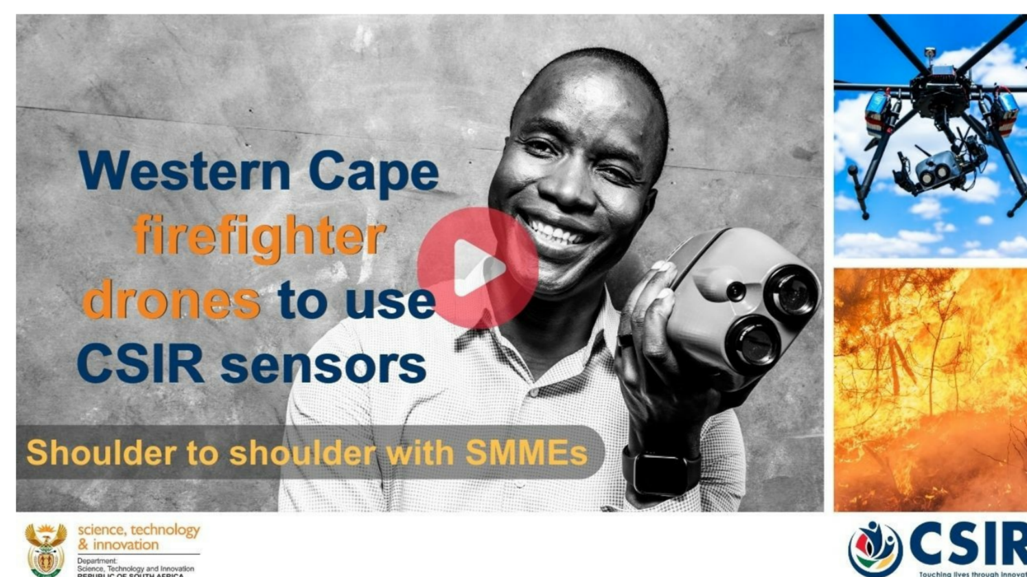
Table Mountain authorities in the Western Cape may soon call on firefighter drones to detect and extinguish small fires in hard-to-reach places before they spread to the City of Cape Town. In March 2024, the CSIR exclusively licensed its K-Line fire sensor to a local company, Autonosky. Read more.