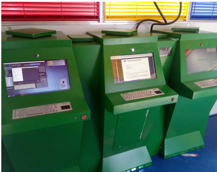
Figure 2: Container Digital Doorway user terminal view