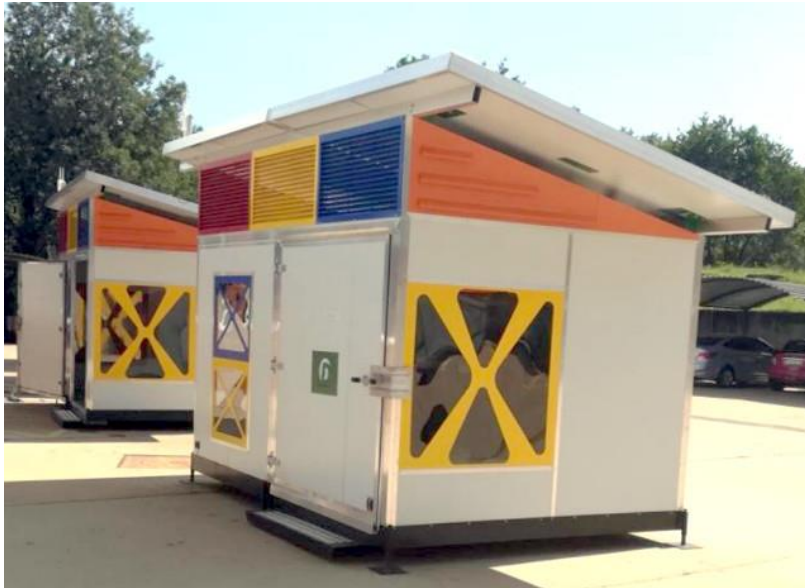
Figure 1: Container Digital Doorway outside view