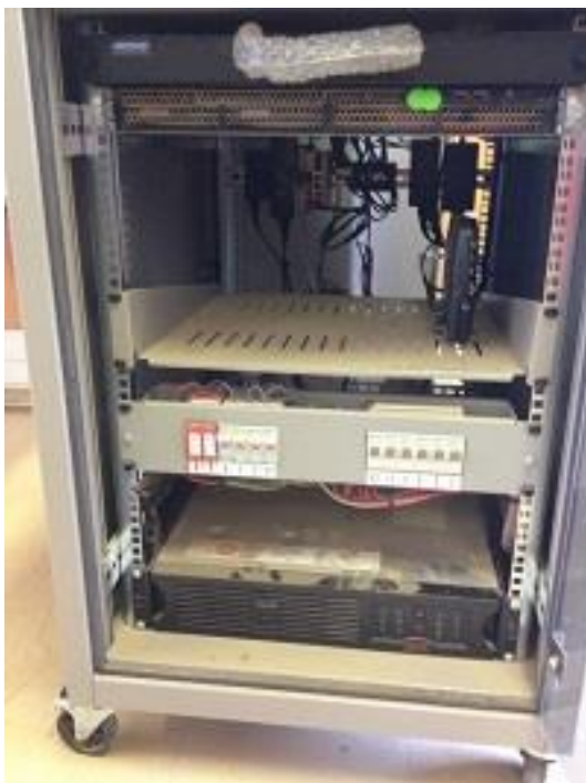
Figure 4: School Media Cabinet

Schools' ICT setup comprises a cabinet housing a media server, UPS, Switch and other equipment inside the cabinet. Users connect to WiFi via mobile devices. Wi-Fi connectivity is provided and interfaces with a local content server. Outdoor Access Points (APs) are provided.